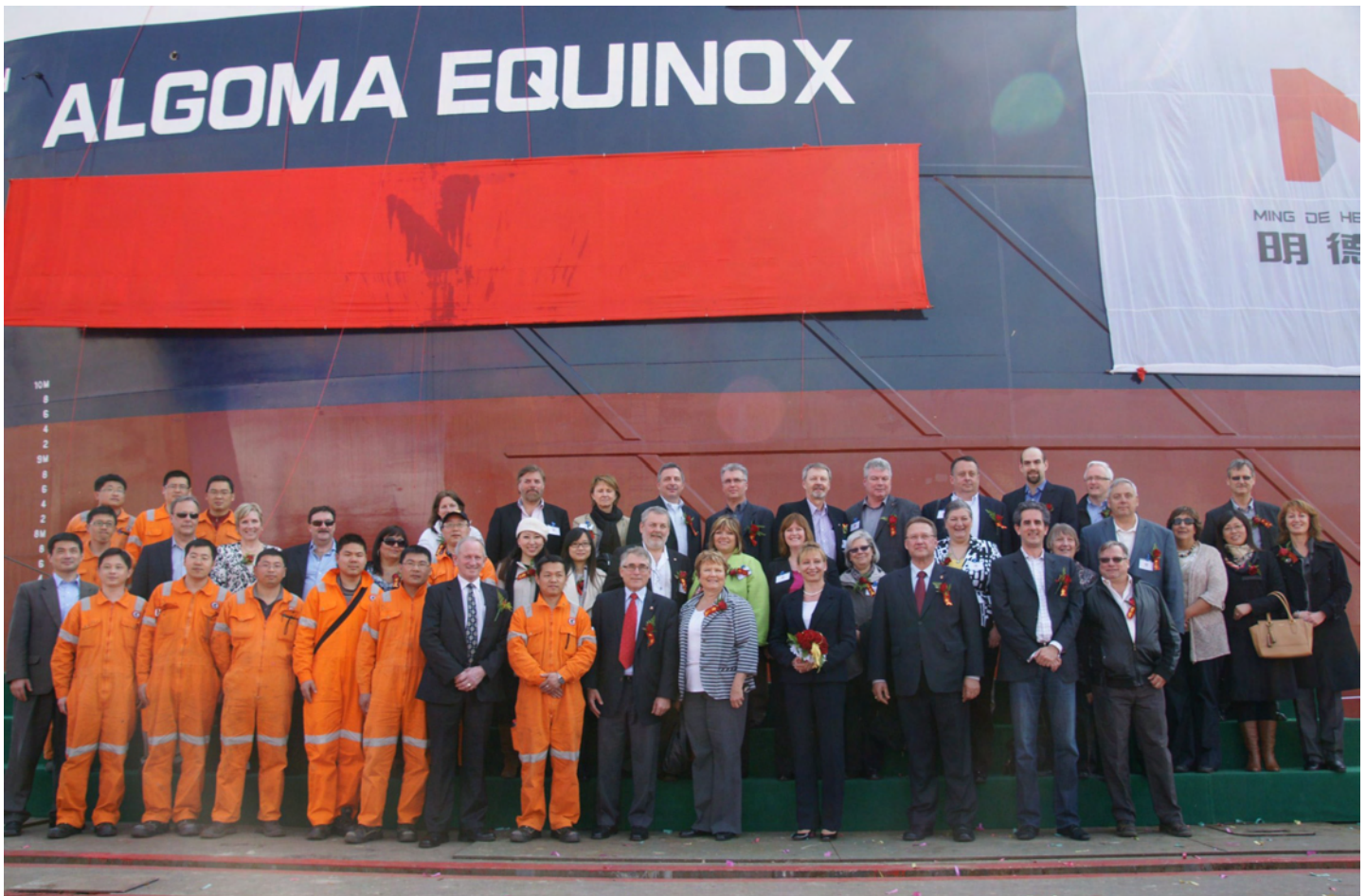
Above: Algoma representatives in front of the Algoma Equinox .