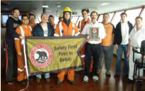
Crew Members of the Algoscotia