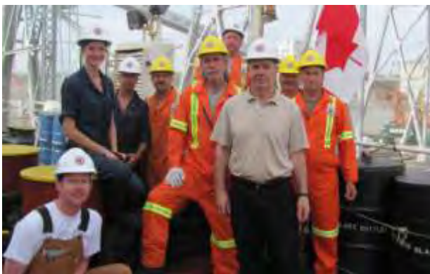
Crew members of the Algoma Guardian

The vessels completed mandated regulatory dry-dockings in China this year. During the dry-docks, the cargo handling gear onboard each ship was removed. Cargoes were secured from China to Mexico and New Orleans to assist in the repositioning of the vessels to Canada. Algoma senior officers joined each vessel in the Panama Canal and New Orleans to help familiarize them with the ships and to learn from the previous crews before taking over vessel operations in Halifax.