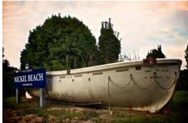
Photo of: The Algobay Lifeboat at Nickel Beach in Port Colborne.

Details for our 2011 photo contest will be in our Spring 2011 issue of BearFacts.