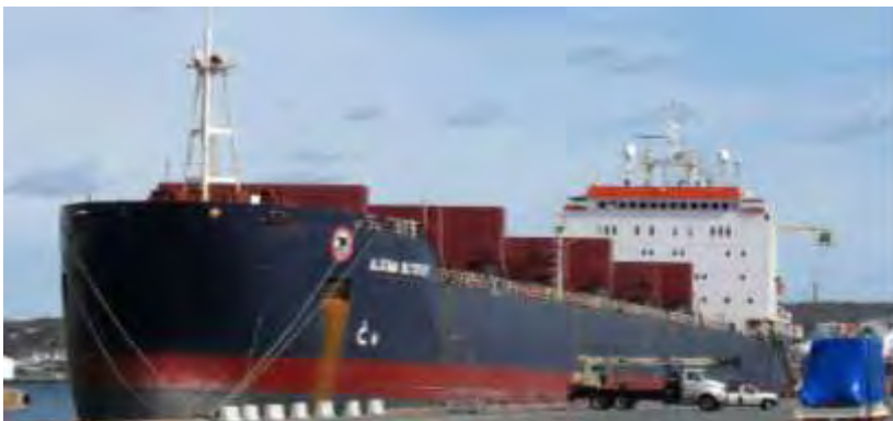
In the Port of Halifax.