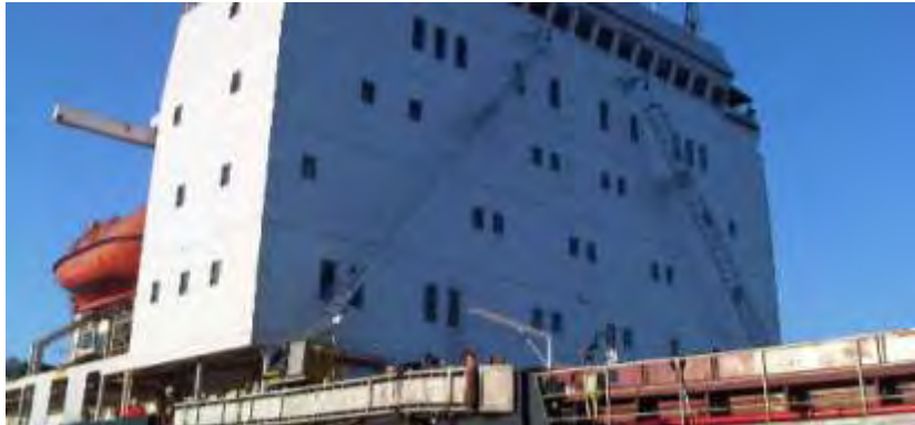
The new boarding ladders installed on the Algoma Guardian.

The advanced planning and preparation will ensure that FMI is able to meet customer requirements on time and on budget.