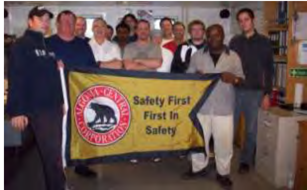
Crew Members of the Algosea