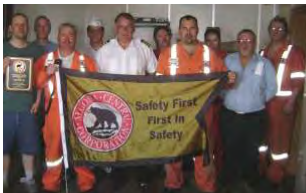
Crew Members of the Algoeast

in dry-bulk shipments although we were pleased to commence some new shipping movements this year. Reduced demand has created extra challenges both ashore and among our fleet. Crewing is one such challenge that we have faced this year. Finding the right balance of personnel for each ship is always our goal and it is our stated preference to have regular crew assignments but with temporary lay-ups of some ships this year we have been faced with more crew transfers than has traditionally occurred. Strong onboard leadership together with our established safety management systems and highly skilled personnel have all contributed to meet these challenges in 2010 and we feel are a tribute to our strong safety culture.