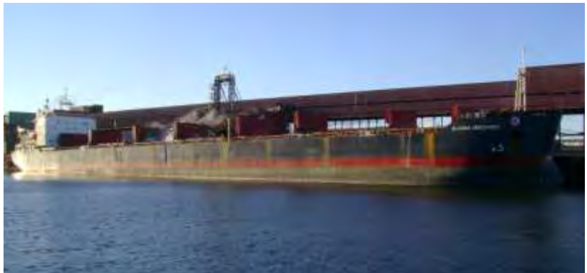
Loading its' first cargo in Port Cartier.