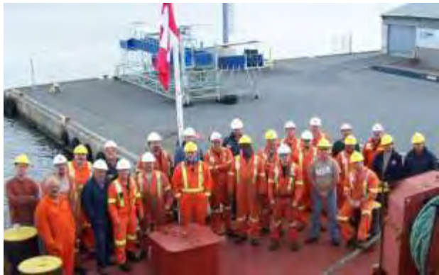
Crew Members of the Algoma Discovery

entering Canadian flag service each ship was issued Canadian certificates. The entire Canadian officer and crew complement of each vessel were given safety and operations management training in areas such as Canada Labour Code and MOSH, Job Observation, Risk Assessment, Injury Prevention, Management of Change, familiarization of the Integrated Management System, Security, WHMIS and Asbestos Management.