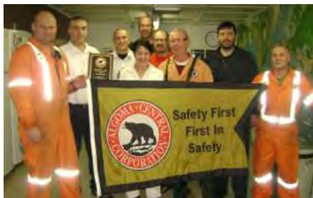
Crew Members of the Algosar

Demand for petroleum product movements in 2010 has been lower than 2009 levels. We have not seen the re-bounce that has been experienced