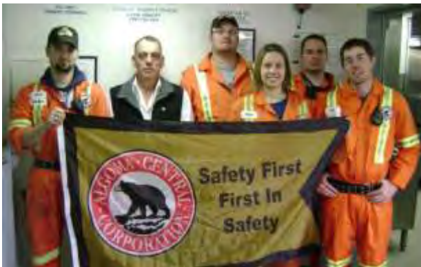
Crew Members of the Algoma Dartmouth