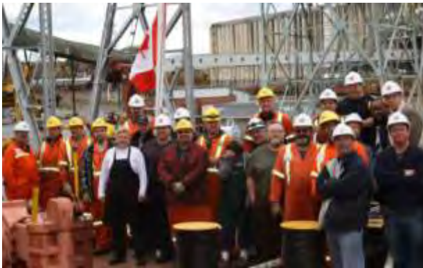
Crew Members of the Algoma Spirit

During 2010, Algoma Shipping Inc. (ASI) transitioned its three “salty bulkers” into long term time charters with Seaway Marine Transport. The ships, Algoma Sprit , Algoma Guardian and Algoma Discovery were built in 1986 ( Spirit ) and 1987 and operated to SOLAS and MARPOL (International) standards. They are capable of world-wide operations. Algoma is providing ship management and crew services for ASI while these ships are in Canadian flag service.