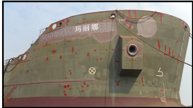
Above : The Algoma Mariner in Chengxi Shipyard in China

Canadian Transport (Algoma Transport) Canadian Enterprise (Algoma Enterprise) Canadian Progress (Algoma Progress) Canadian Olympic (Algoma Olympic) Canadian Navigator (Algoma Navigator) John D. Leitch Canadian Transfer (Algoma Transfer) James Norris Canadian Mariner (Algoma Mariner) Canadian Provider (Algoma Provider) Gordon C. Leitch Montrealais (Algoma Montreal) Quebecois (Algoma Quebec)